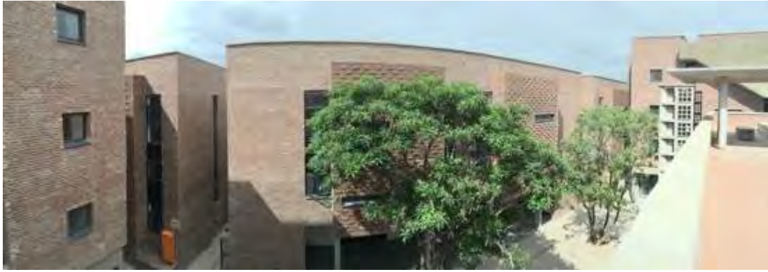
Fig 10.5: Residences at the University of Mpumalanga.