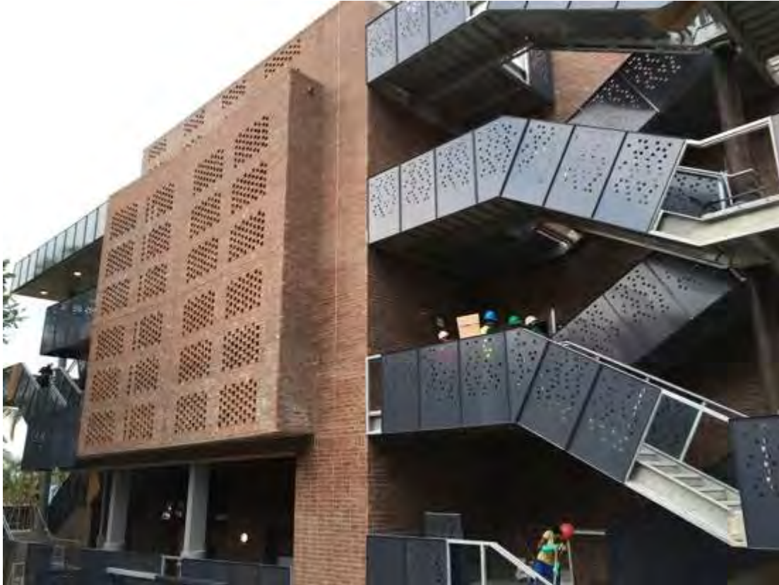
Fig 10.8: Academic Teaching and office building as part of the first phase of completed buildings at the University of Mpumalanga