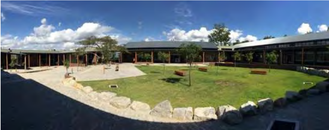
Fig 10.4: Courtyard in the Science Block at the University of Mpumalanga.