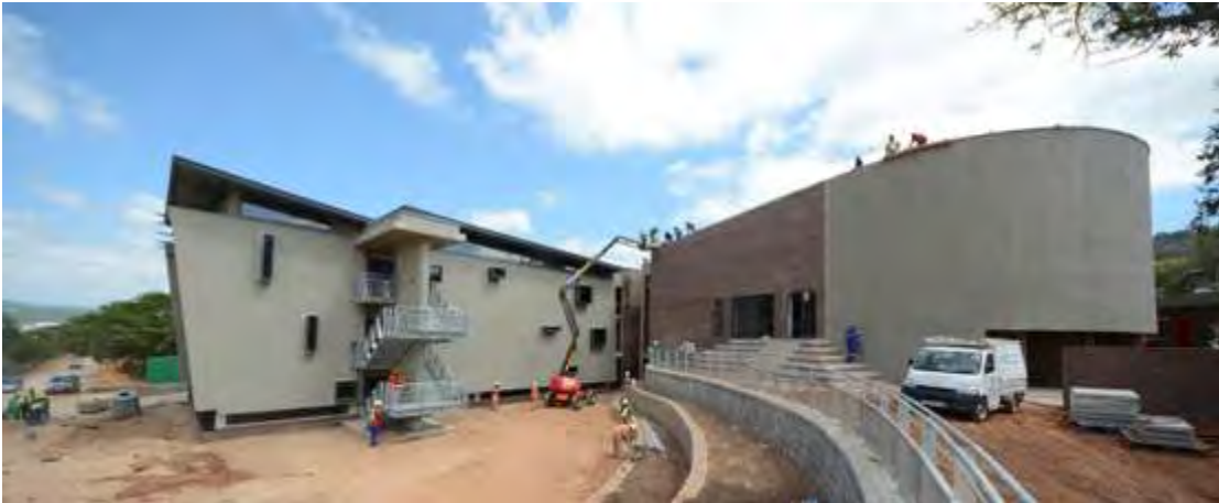
Fig 10.10: Auditorium and Library building within the Science Block at the University of Mpumalanga

augmenting the higher education landscape. Inside all these new university buildings, sitting in the lecture theatres, working in the laboratories, populating the residences, utilising the libraries, IT and recreational facilities, are South Africa's next generation of professionals, artisans, managers, technicians, academics and researchers. Both universities are forging ahead with their expansion and physical capacity, continuing to target their aim to be centres of academic excellence, innovation and relevance - engaged within their settings.