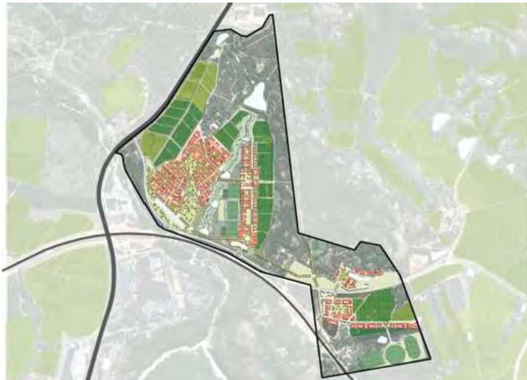
Fig 10.2: Overall development plan of the Mbombela Campus of the University of Mpumalanga