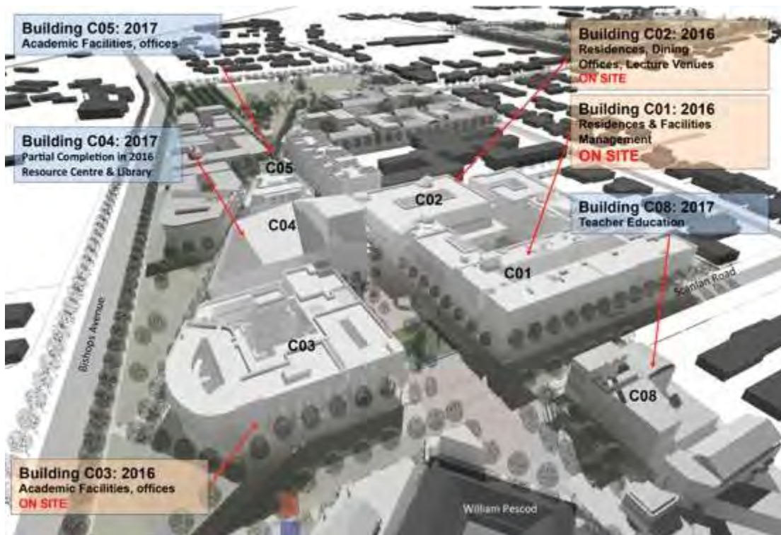
Fig.10.12 Impression of the first two phases of buildings to be completed at the Sol Plaatje University