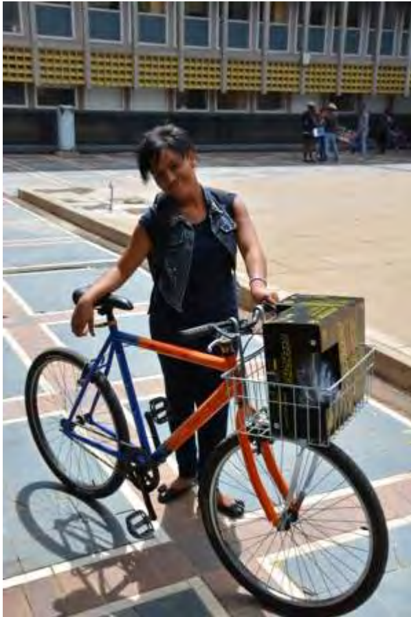
Fig 10.7: Students and staff receive a university branded bicycle to commute to and from campus at the Sol Plaatje University.

Equity of access demands that all have equal access to all facilities and amenities on campuses. The principles of Universal Access have been used from the onset of the planning and design process to promote human equity and dignity. This includes ensuring that all renovated and newly constructed buildings are free of potential environmental barriers and consistently follow accessibility standards throughout the campuses. By ensuring ease of access to the university campus, the shared spaces and facilities support independent living and full participation in all aspects of university life, ultimately reinforcing the inclusion and integration of diverse members of society.