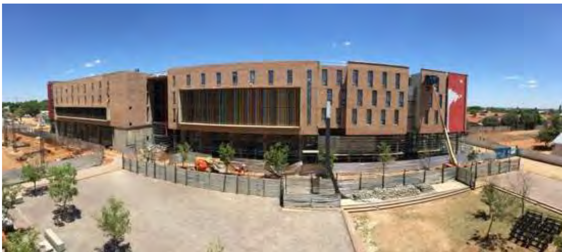
Fig 10.3: Central Campus Square Sol Plaatje University as focus for surrounding academic and residential buildings.

At the University of Mpumalanga, where the setting is more rural, the academic buildings were designed to maximise spaces for chance encounters and exchange amongst students and staff. All buildings have attractive courtyards, designed to provide quiet landscaped contemplative spaces, or for gatherings to discuss and deliberate, or for people to simply enjoy sharing. (Fig. 10.4)