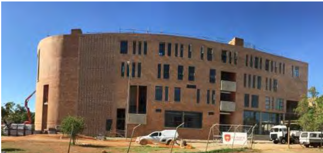
Fig 10.9: Academic Building as part of the first phase of completed buildings at the Sol Plaatje University