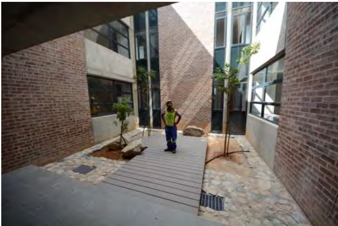
Fig 10.6: Residences are arranged as several smaller buildings clustered around varying central courtyards and gardens at the University of Mpumalanga.